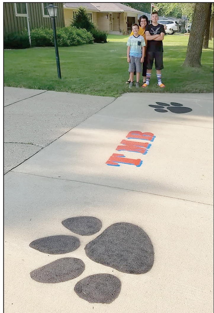
THE COCHRAN FAMILY was proud to display their Panther paws and "TMB" logo during the last such fundraiser. Submitted photo